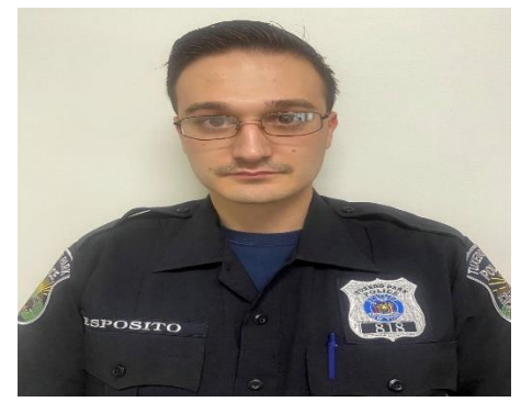
Village of Tuxedo Park Police Department Annual Report 2022