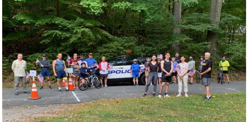
Village of Tuxedo Park Police Department Annual Report 2022

We also plan on increasing community policing and hold events such as Coffee with a Cop as well as other events to enhance interactions with the police officers and the community. We encourage the community to bring any ideas forward that you would like to see.